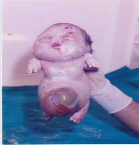
Figure 1: Macroscopic appearance of the newborn.

She suffered an acute respiratory distress, extreme bradycardia and died 1 hour after delivery. The diagnosis of thanatophoric Dwarfism was suspected. Therefore, it was supplemented by a radiological