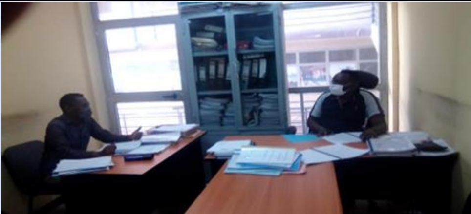
Figure 2: interview made with key informants of government sector about their Environmental policy practices