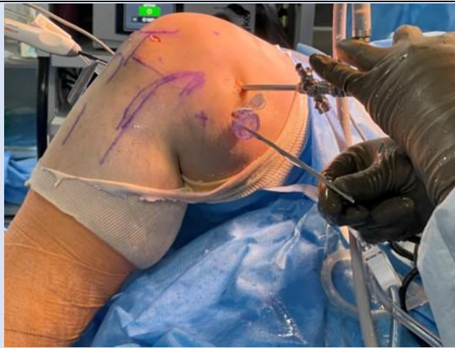
Figure 3: Right knee, knee flexed. Medial knee with skin markings to establish dual posteromedial portals.

The procedure began with the application of a tourniquet and an anesthesia evaluation indicated no instability in the knee. Diagnostic arthroscopic examination was conducted using anterolateral (AL) and anteromedial (AM) portals in the right knee (Figure 3) which visualized within the medial compartment, a flap tear at the medial aspect of the medial femoral condyle, near the root of the intercondylar notch. Additionally, fibrillation was found in the patellofemoral joint. Both menisci were intact, and the anterior cruciate ligament (ACL) was also found to be intact. The cyst was identified anterior to the PCL, and the scope was passed between the ACL and PCL to visualize the posterior compartments (Figure 4).