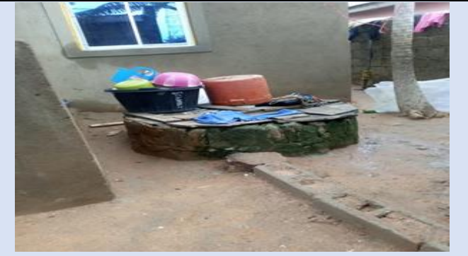
Plate 4: Cemented shallow well at Angwan bakassi.