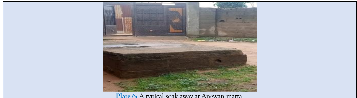
Plate 6: A typical soak away at Angwan matta.

The findings of the study revealed that the main source of domestic water for household use are the piped public water system, borehole, hand dug well and surface stream water. However, not all the houses are connected to the piped water system and the water supply from the piped water is intermittent as the water are pumped once in a week, two or a month as the case maybe. Most well-to-do households in the study area rely on boreholes while the poor and low-income households especially those living in rented houses rely on hand dug well, open stream or water from the vendors for their domestic water needs. Thus, the hand dug shallow well are predominantly used by people of