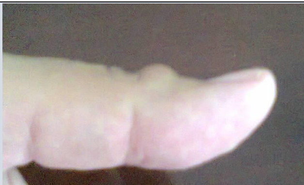
Figure 1B: A cystic lump on the dorsum of the terminal phalanx of the left thumb

Although consensus has not been confirmed regarding the treatment of digital mucous cyst, the patient in this paper was consulted according to the available evidence suggesting in such small and asymptomatic lesion, no further treatment or follow-up is necessary [4,5].